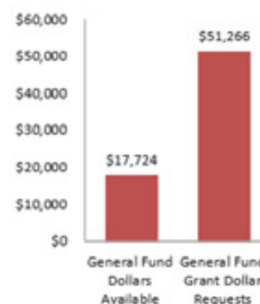
GENERAL FUND GRANT REQUESTS

Sanford Luverne Medical: $6120 for a transvaginal probe Luverne Backpack Program: $5000 for weekend nutrition needs for students LIFT/Luverne Farmer's Market: $2500 Healthy eating program/family education Rock County Ag Society: $1400 Handwashing stations at the fairgrounds Rock County Ag Society: $500 AED machine with $500 match from Sanford Luverne Luverne Public School: $2,458 Flu shot clinic Hills-Beaver Creek School: $816 Flu shot clinic Lutheran Social Services: $513 Shelf stable meals for seniors Sanford Luverne Medical Center: $10,000 for a fluid control system Luverne Backpack Program: $2800 for food supplies Good Samaritan Society, Mary Jane Brown Home: $1273 for a code crash cart Sanford Luverne Hospice: $250 self-care for professionals workshop Southwest Crisis Center: $2000 for social media exploitation education SHARE: $1000 for senior citizen meals Luverne Fire Department: $2,015 AED and neck/backboard supplies