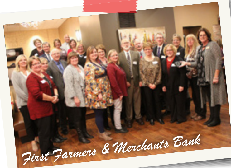
First Farmers & Merchants Bank

In 2017 these 3 award winners were recognized for doing just that.