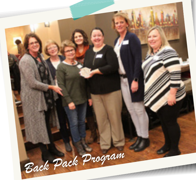
Back Pack Program